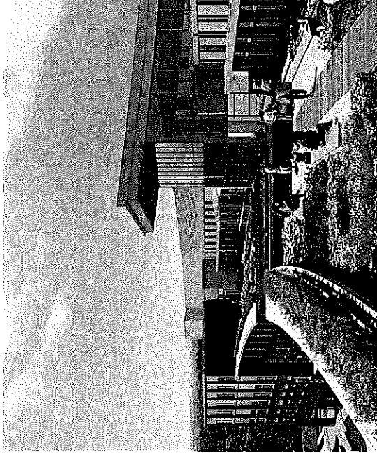
Waltham High School

The SMMA is a charitable organization established by the directors of Symmes Maini & McKee Associates, Inc. to support the communities that SMMA serves and the charitable activities of its employees. The Fund provides assistance to organizations and individuals through scholarships and grants.